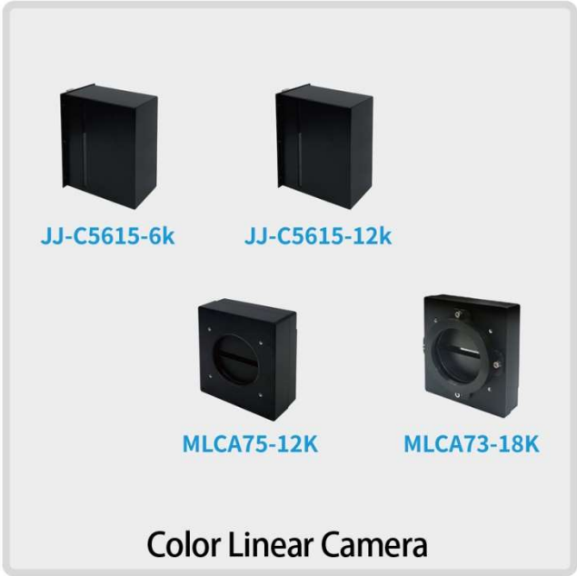
Color Linear Camera

For more information, please visit our website www.microtek.com .