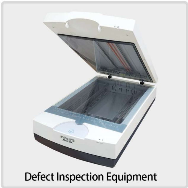
Defect Inspection Equipment